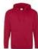
Red Hot Chili