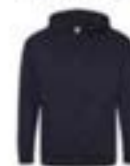
New French Navy*